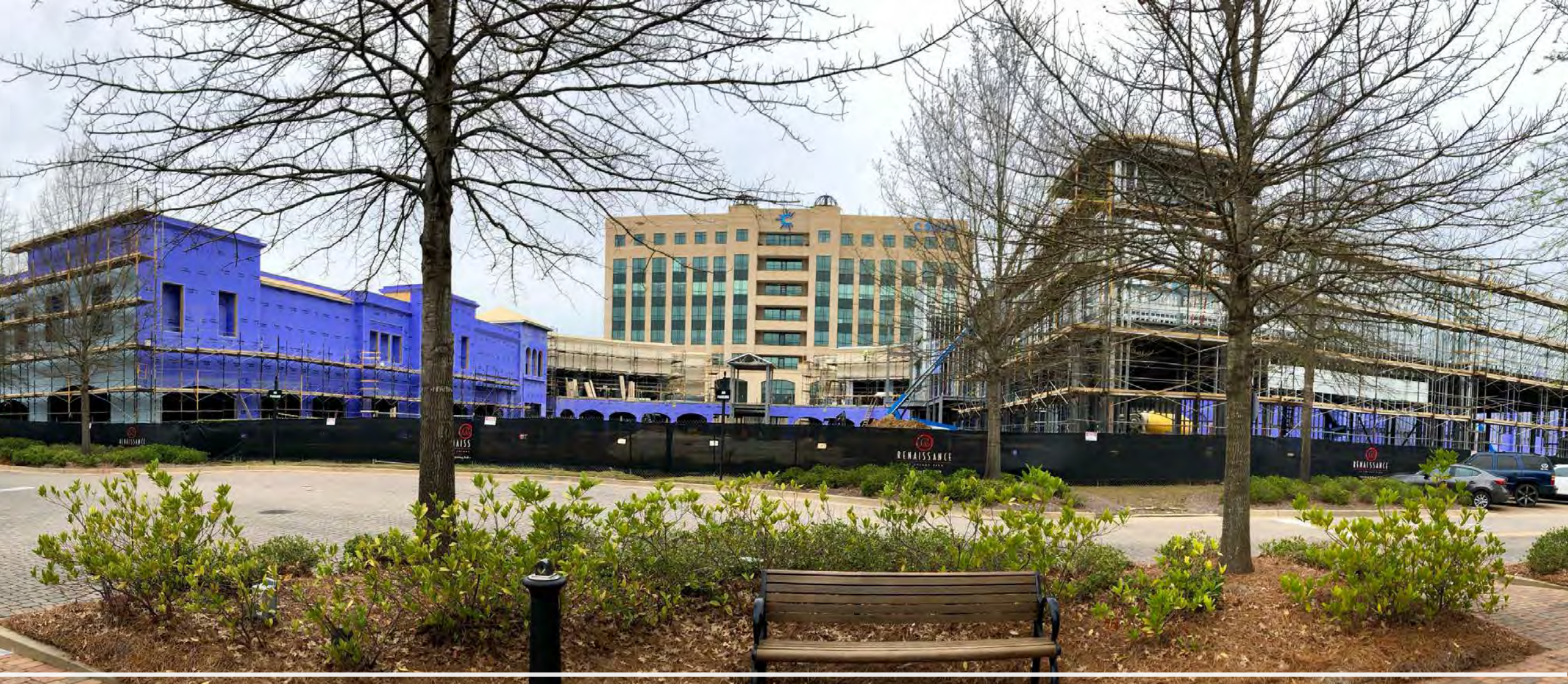
Renaissance Phase II